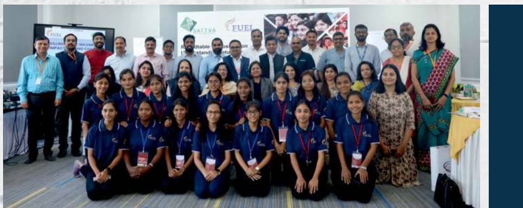
Round table Discussion On Understanding Return on Investment for Opportunities for the young talents and measure the ROI of skilling program