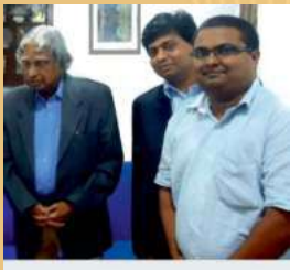
FUEL team with Dr. A. P. J. Abdul Kalam Former President of India

“Join FUEL Business School to blend business acumen with social impact, empowering you to make a meaningful difference. Gain practical insights, networking opportunities, and expert faculty support. Enroll now and unlock your leadership potential in social work and women empowerment. Together, let’s empower women, uplift underserved youth, and drive positive change.”