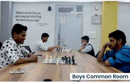
Boys Common Room