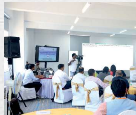
FUEL organized event on 5 Sep 2023 on Skilling India : Maximizing Impact, Driving Skilling Interventions. The objective of this event was to provide oppor